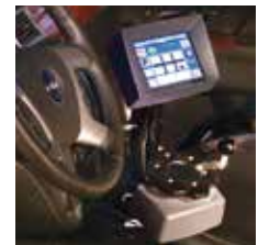
Electronic control systems