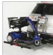
Lifts and stowage products