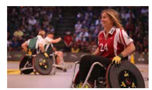
PVA Awareness Month recognizes Veterans living with Spinal Cord Injury and Disorders.

WASHINGTON, DC (March 28, 2019)—In April, during PVA Awareness Month, Paralyzed Veterans of America will celebrate the strength and perseverance of its members—veterans living with spinal cord injury and disorders (SCI/D), as well as MS or ALS — by sharing their inspirational stories. The organization will also highlight its efforts to ensure that veterans ..continued on page 4.