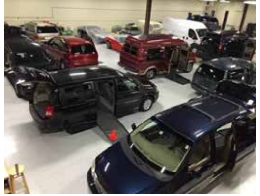
New England's largest indoor showroom!

www.newenglandmotorcar.com (603) 888-1207