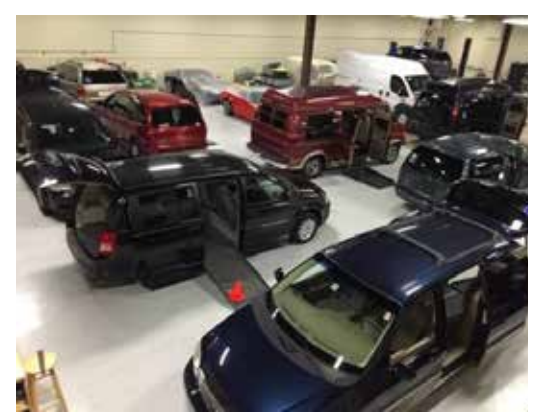
New England's largest indoor showroom!