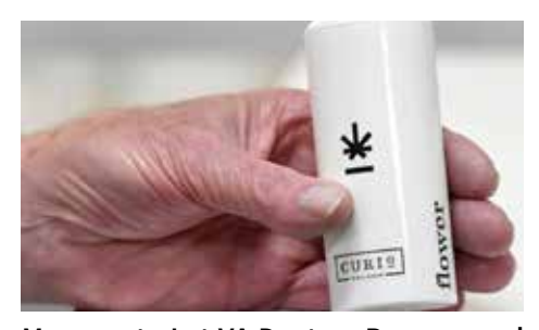
Measure to Let VA Doctors Recommend Medical Marijuana was Again Left Out of Budget Bill.

WASHINGTON – A measure to allow doctors at the Department of Veterans Affairs to recommend marijuana in states where it's medically legal failed to make it into the final version of a VA funding bill for the third consecutive year.