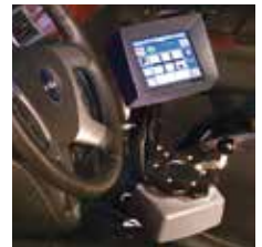
Electronic control systems