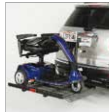
Lifts and stowage products