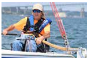
Sail To Prevail