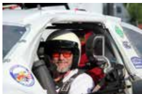
Riverside Accessible Racing pictures taken by Chapter member Debra Freed.