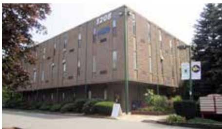
NEW ENGLAND CHAPTER OFFICES