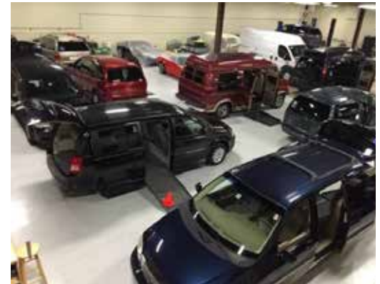
New England's largest indoor showroom!

We will work with each veteran to fulfill their freedom of returning to the community. Our goal is to provide a veteran with the necessary equipment needed to make independence possible. We take pride in New England and thank the veterans who proudly serve!