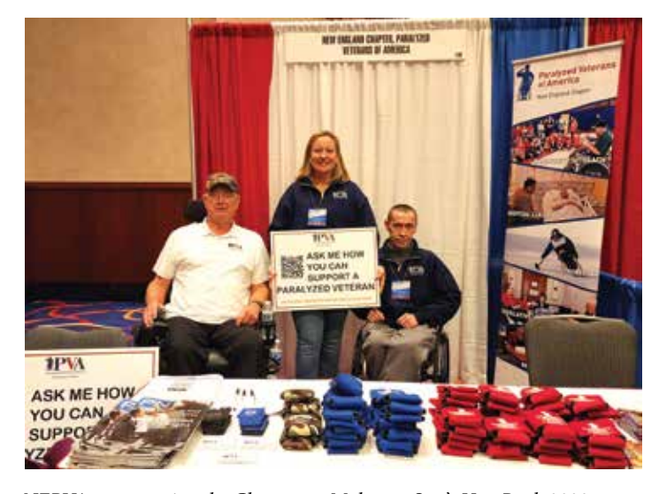
NEPVA representing the Chapter at Mohegan Sun's Vets Rock 2022, an annual event saluting and supporting Veterans across New England.

We also partnered with National PVA to host several adaptive sporting events for our members throughout New England. Our Disc Golf Clinic (held in Canton, MA) was well-attended and introduced many of our members, including myself, to a new and enjoyable recreational activity. The Wheelchair Basketball Clinic, held at Southern CT State University, brought PVA members throughout the country together for a weekend of exercise and friendly