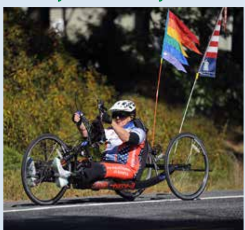
A MEMBER CHAPTER OF THE PARALYZED VETERANS OF AMERICA CHARTERED BY THE CONGRESS OF THE UNITED STATES