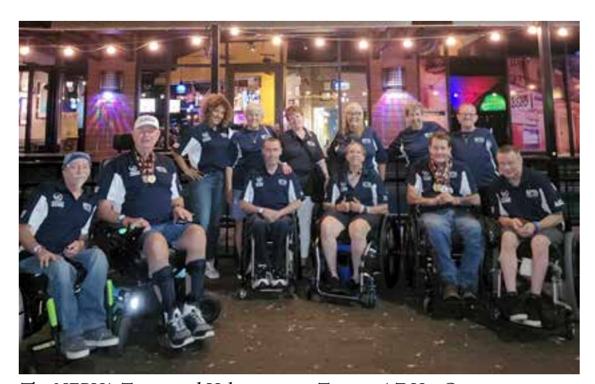
The NEPVA Team and Volunteers at Tempe, AZ Vet Games.

Unfortunately, for the first time in many years, the Long Term Care veterans at Bldg 8 did not participate in person. However, they did participate from their home at Bldg 8.