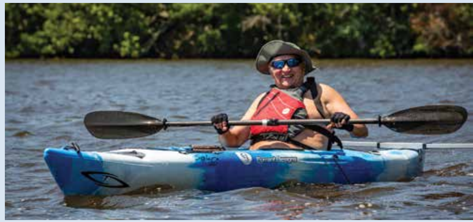
NEPVA ANNUAL REPORT JUNE/21-JULY/22

Advocacy • Research • Recreation Legislation • Public Awareness