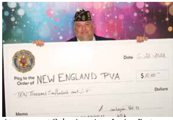
At our recent Gala, American Legion Post 41 Presented a Check as a donation for the Chapter Bass Trail.