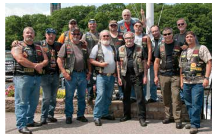
The Nam Knights have been there from the beginning helping disabled anglers on to the boats.