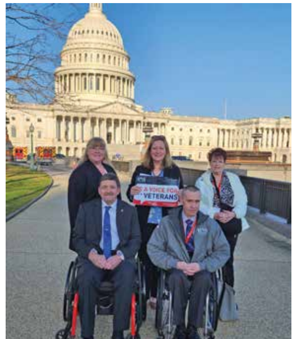
Members of the NEPVA team on Capitol Hill and with Congressman McGovern of Massachusetts.