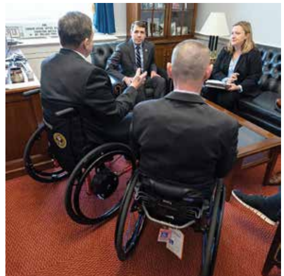
Congressman Pappas meets with the NEPVA team.

Please take a moment to fill in your information so an automated email in support of these issues will be sent directly to your Representatives in Congress.