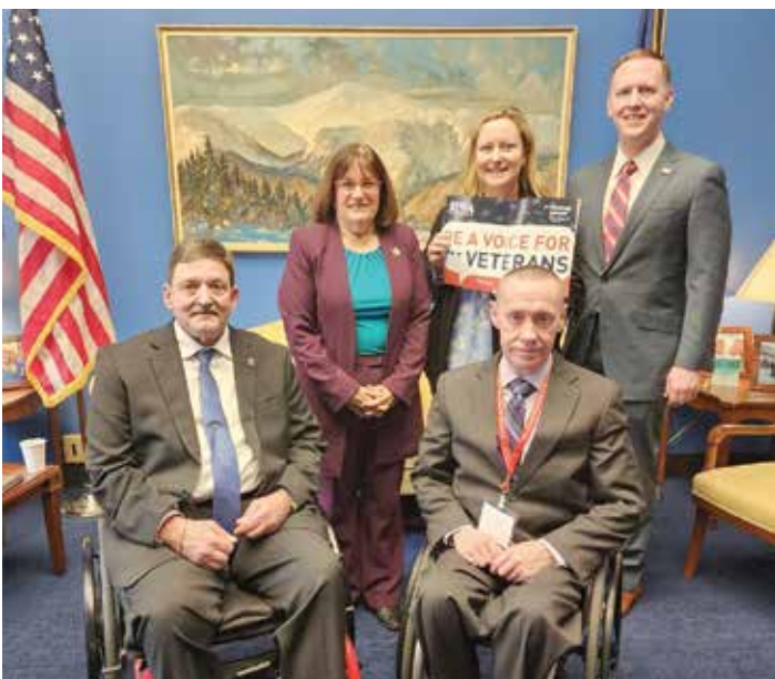
Congresswoman Kuster meets with members of the NEPVA team.

All gifts to our Chapter help paralyzed veterans receive life-changing care, earned benefits, employment services, access to recreational activities and benefit from groundbreaking research, all free of charge.