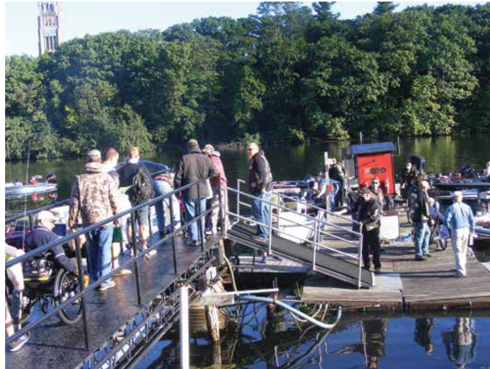
This will be the scene June 3 as the Nam Knights assist the disAbled anglers onto the bass boats for a great day of fishing on the Charles River. Sign up on the Chapter website.