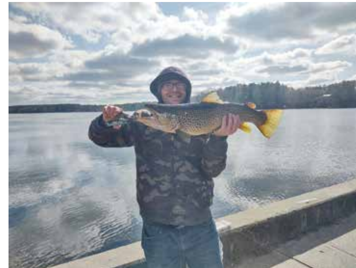
Nice 8 pound Brown trout from accessible shore fishing spot.

September 29-October 1, Maine Bass Tournament, Camp Wavus, Maine