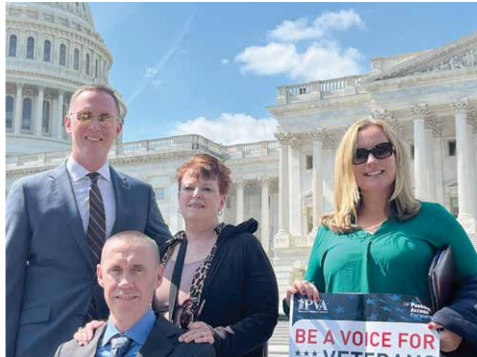
NEPVA on Capitol Hill