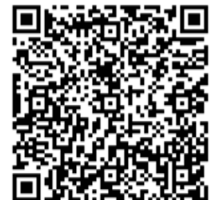
Gaylord Fishing QR

including; fishing, golf, archery, bocchia, kayaking and yoga.