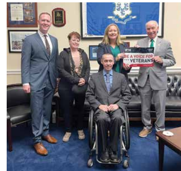
NEPVA with Congressman Courtney.