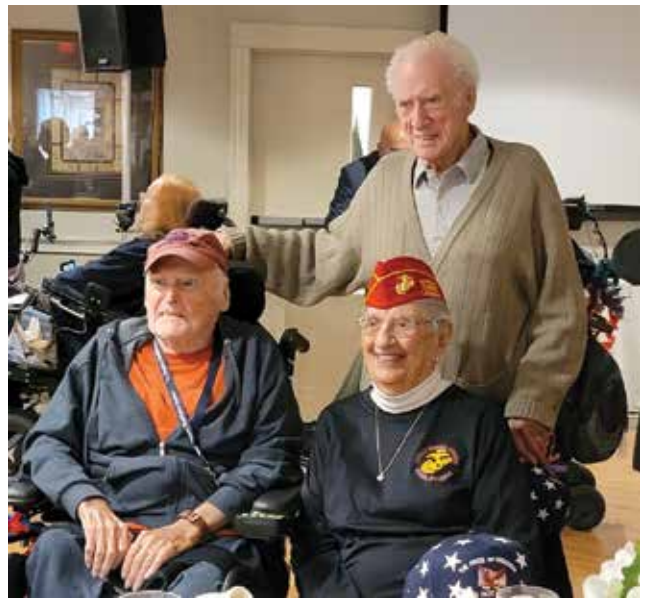
The Quicy Elks held a Veteran's Day event. A number of Vets were there including three WWII Veterans.