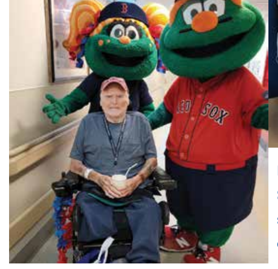
Many thanks to the Red Sox Foundation for their support of Veterans and our Chapter.

Wally the Green Monster and his little sister Tessie helped celebrate Veteran's Day at the VA. They even brought a World Series trophy.