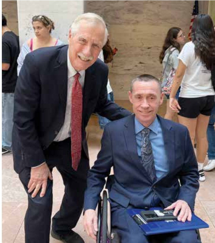
Brad with Senator King of Maine.