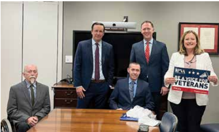
Meeting with Senator Murphy (CT)