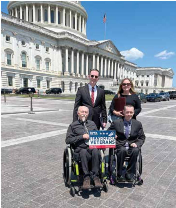
NEPVA on Capital Hill

https://us06web.zoom.us/j/88421598451?pwd=fBugiSHbVgB0QNgBtHaDOQQ7h9kGAq.1