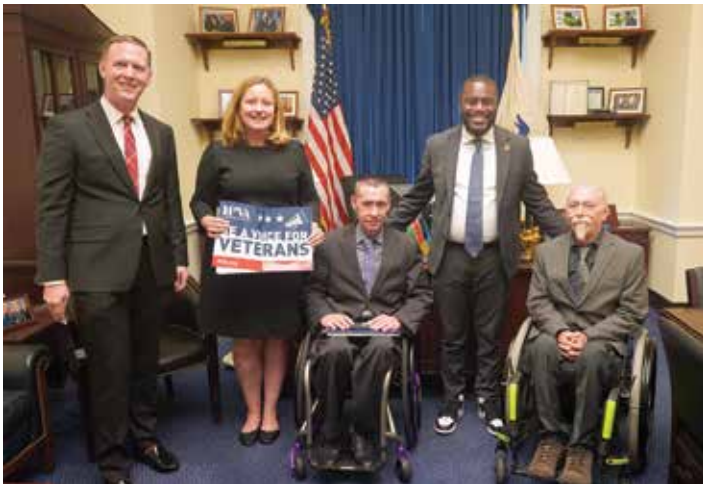
Meeting with Congressman Amo (RI)

We learned about specific and current bills that relate to all these issues, including the Veterans Accessibility Act, Justice for ALS Veterans Act, Veterans Infertility Treatment Act, Disability Employment Act, the Elizabeth Dole Home and Community Based Services for Veterans and Caregivers Act, Autonomy for Disabled Veterans Act, the VETS Safe Travel Act, and the Stop the Wait Act. This training was very helpful to us as we prepared to go to Capitol Hill for 2 days of articulating the needs of our members and their families and caregivers.