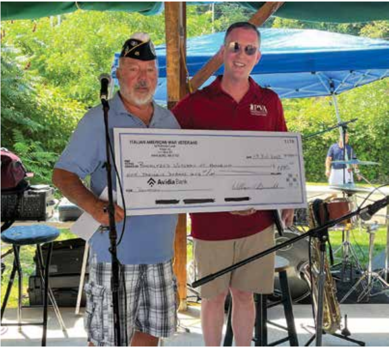
We received a generous donation from the Italian American War Veterans, Post 45, Marlboro, MA.