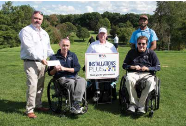
Installations Plus made a generous contribution to our annual golf tournament fundraiser.