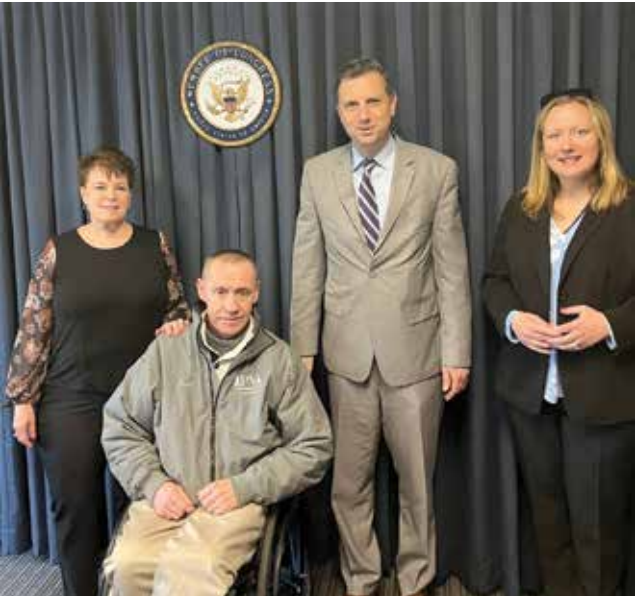
Warick, RI to meet with Congressman Magaziner.

We also continue to promote National PVA’s VoterVOICE platform, which is an essential tool in our advocacy efforts. We frequently advertise VoterVOICE opportunities on Facebook, in our newsletter, and at both Chapter and community events. As we enter a new fiscal year, our Chapter will continue to foster strong relationships with the New