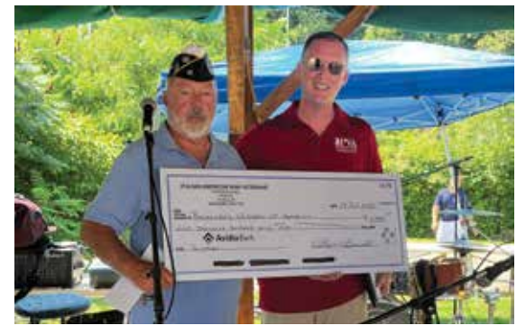
We are thankful for the ongoing support of the Marlboro Italian American Veterans, Post #45.